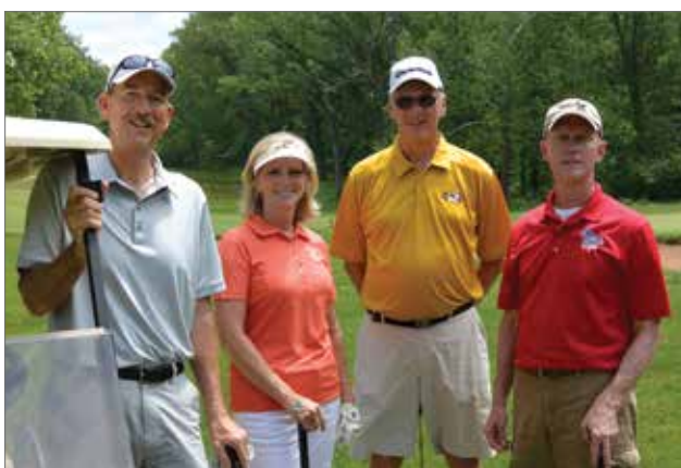
Teams from across the state gathered in support of Missouri 4-H Youth. Among the teams competing for prizes were CenturyLink (top) and MFA (bottom).